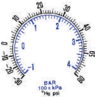
Typical Compound Gauge Dial