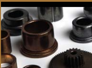
IMPREGNATING OILS & GELS Premium Lubrication for Sintered Metal Bearings