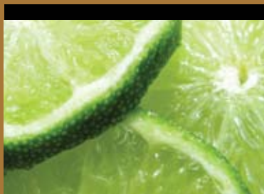
FOOD GRADE LUBRICANTS Premium Synthetic Lubricants for the Food Manufacturing & Processing Industry